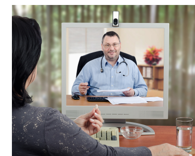
TELEHEALTH COACHING AT A VETERAN'S HOME

is an intervention that helps Veterans achieve a higher level of well-being and performance in their life and work, especially when change is difficult! The traditional medical model seeks to diagnose what is wrong with a Veteran and fix it. The telehealth coaching approach instead seeks to discover what is right with the Veteran and expand it. Early on in telehealth coaching a patient health inventory is completed to determine what part of life the Veteran would like to focus on improving. By linking a Veteran's values and strengths to their health goals, studies have shown long term lifestyle changes are possible.